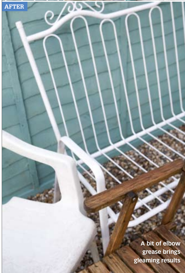
A bit of elbow grease brings gleaming results

Sitting out in the garden is one of summer's pleasures, but is your outdoor furniture fit for the job? With a bit of effort, you can rejuvenate dirty or tired-looking wood, metal, canvas and, to some extent, plastic.