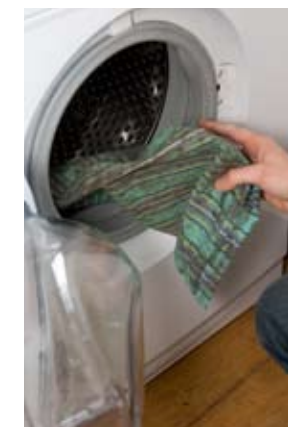
Bring canvas back to life with a machine wash

Spray new canvas with a waterproofing product such as Nikwax UV Proof (£6.99 for 500ml, 0800 665 410, www.blacks.co.uk ) to keep chairs and parasols left outside all summer in good condition.